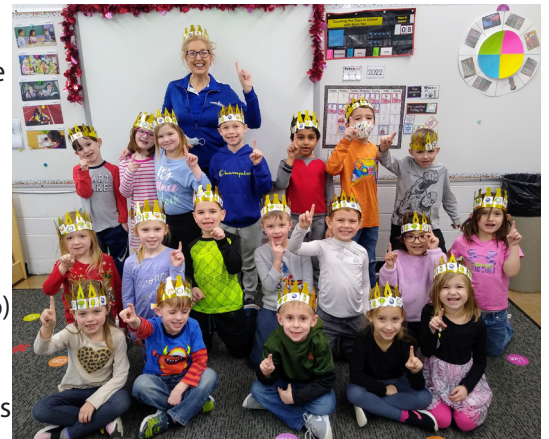
Shelbyville Kindergarten Center

We read "DW The Picky Eater," and the students got to try their very own sugar snap pea! We talked about the look, feel, sound (snap) and taste. After becoming the kings and queens of trying new things, students designed their own crowns to wear for being a part of the "One Bite Club!"