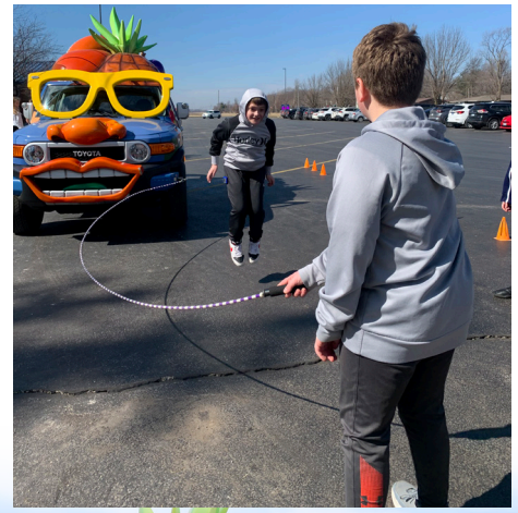
Riddle Elementary, Mattoon

As weather permits, we are excited about visiting schools with the KickStart vehicle to have fun while staying active! Through interactive features like jumping rope, dribbling balls, running through obstacles, balancing and using quick feet, we get to be active together. The Kickstart car always proves to be a blast for the students.