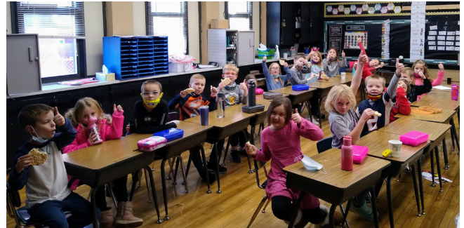
Main Street Elementary, Shelbyville

What better way to start the New Year than remembering how important it is to eat healthy and nutrient-dense foods! During our January lesson students were taught the difference between good "whole" calories and bad "empty" calories. The lesson, titled "Simple Swaps" helped the students understand the concept of empty calories that do not benefit our bodies versus nutrient-dense calories that are healthy. We ended the lesson with the "Simple Swap" card game where students were able to eliminate and identify an empty calorie food with the healthiest swap between four cards. The healthy snack of the month was whole grain rice cakes, and they were a hit!