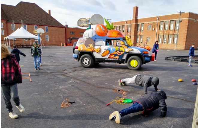
Main Street Elementary, Shelbyville